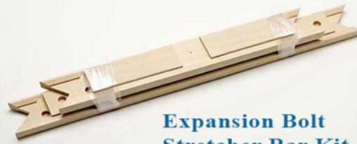
Expansion Bolt Stretcher Bar Kit

Phone: 707-433-4238 Toll free: 888-471-4448 Store hours (PST): M-F 10am - 6pm; Weekends by appointment 259 Brandt Road PO Box 181 Healdsburg, CA 95448